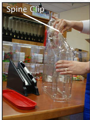
1.Lid/Clip Removal Remove bin base stand, lid and spine clip