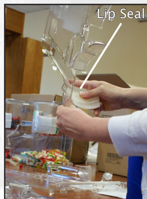
6.Remove Band Take 2 sides of bin body apart and remove rubber lip seal. Replace with polycarbonate lip seal (see inset right, #19).