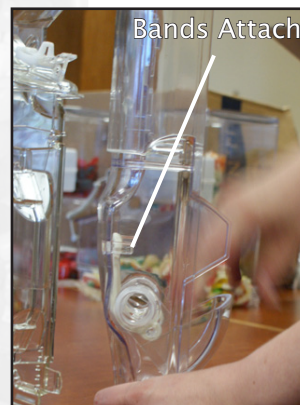
3.Door Swap Remove bin handle and replace rounded door with portion control door (see inset below, #20). Secure door return bands as shown.